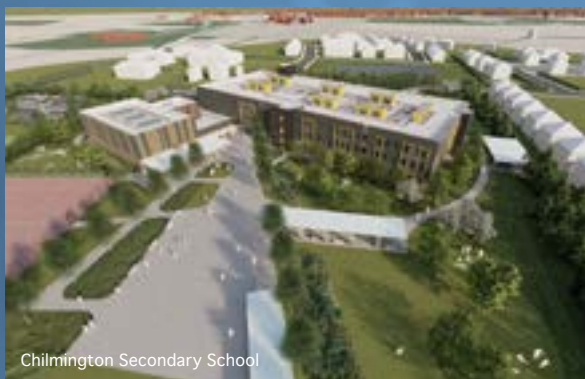
Chilmington Secondary School

Chilmington Secondary School will feature an energy efficient zero carbon main building of three storeys in height. It will also have a large sports centre which will include a four-court sports hall and a fitness/exercise studio.