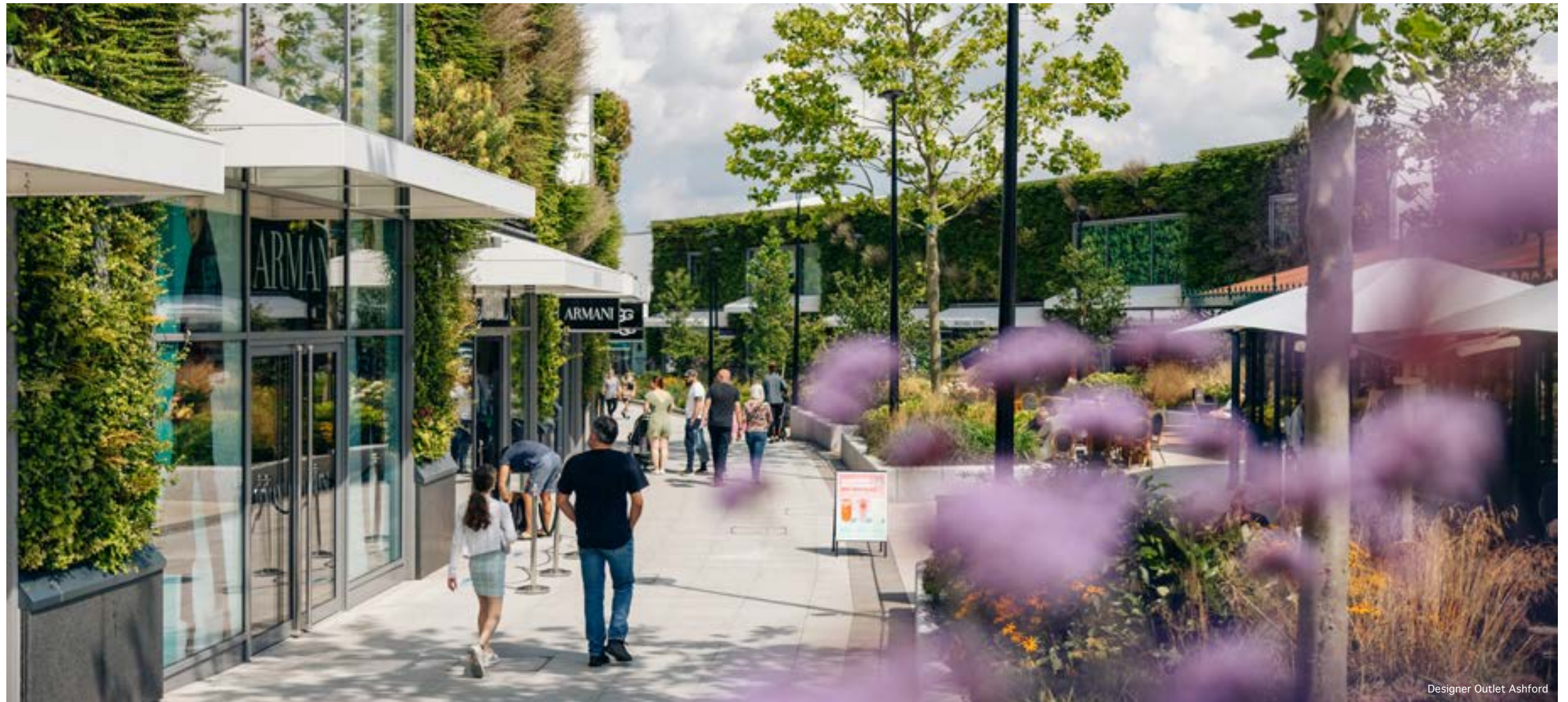
Designer Outlet Ashford